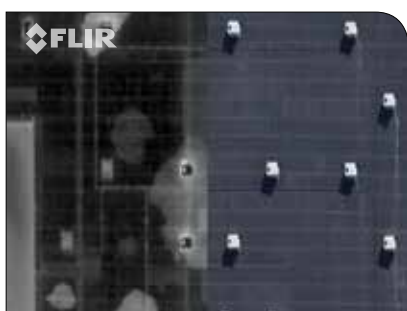
Find water damage in seconds.

Unmanned Aerial System (UAS) equipped with a thermal imaging camera for inspection of commercial and residential buildings